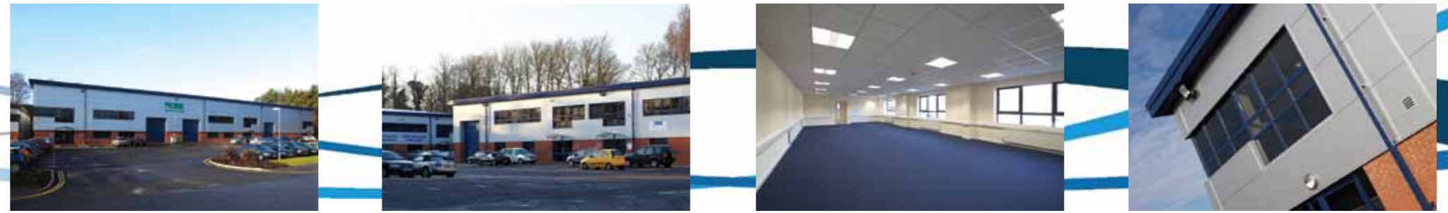
Selected images of completed PHASE 1

Pirbright Road | Normandy | Nr. Guildford GU3 2DX